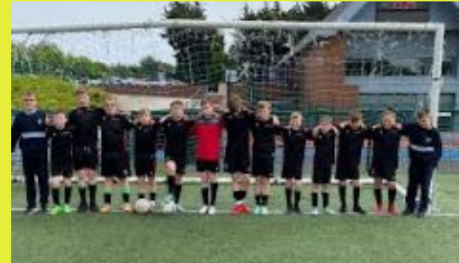
FAI Cup Winners