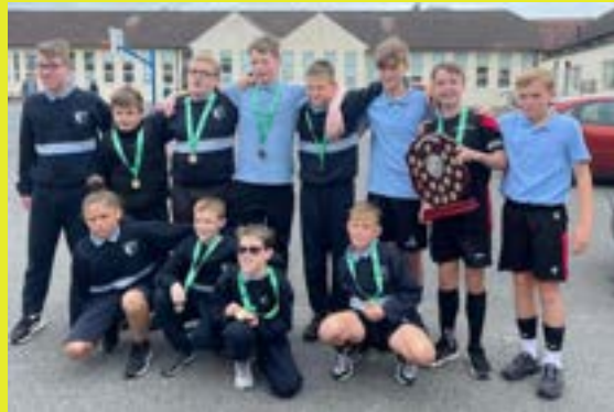
FAI Division League Winners