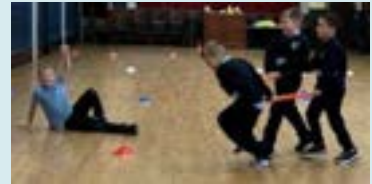
Healthy Kidz & GAA